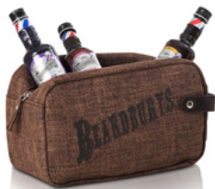
Product Pack - Vanity Case