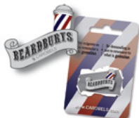
Beardburys Lapel Pin